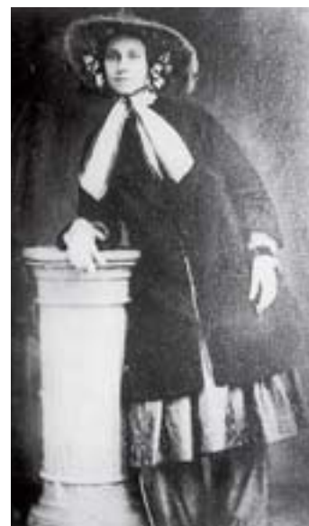
▲ Amelia Bloomer adopted the full trousers that became known as bloomers in 1851.

SENECA FALLS In 1848 Elizabeth Cady Stanton and Lucretia Mott decided to hold a women’s rights convention. They announced what would become known as the Seneca Falls Convention (for the New York town in which it was held). Stanton and Mott composed an agenda and a detailed statement of grievances. Stanton carefully modeled this “Declaration of Sentiments” on the Declaration of Independence. The second paragraph began with a revision of very familiar words: “We hold these truths to be self-evident: that all men and women are created equal.” Some of the resolutions that were also proposed at the convention spoke to the circumstances with which women reformers had struggled.