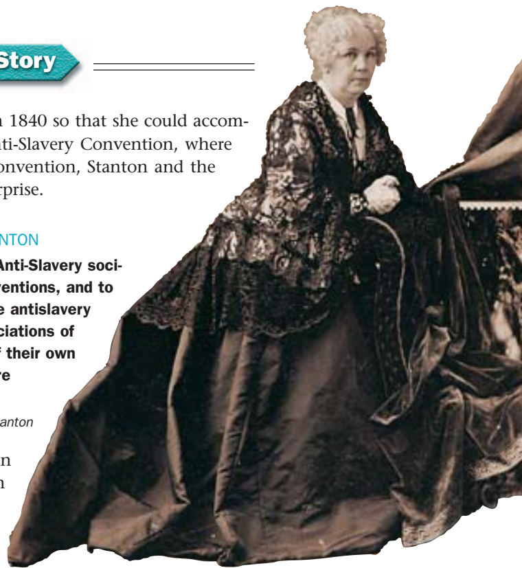
▲ Elizabeth Cady Stanton

At the convention, Stanton found a friend in the Quaker abolitionist Lucretia Mott . Stanton and Mott vowed “to hold a convention as soon as we returned home, and form a society to advocate the rights of women.” They kept their pledge and headed the first women's rights convention, assembled at Seneca Falls, New York, in 1848.