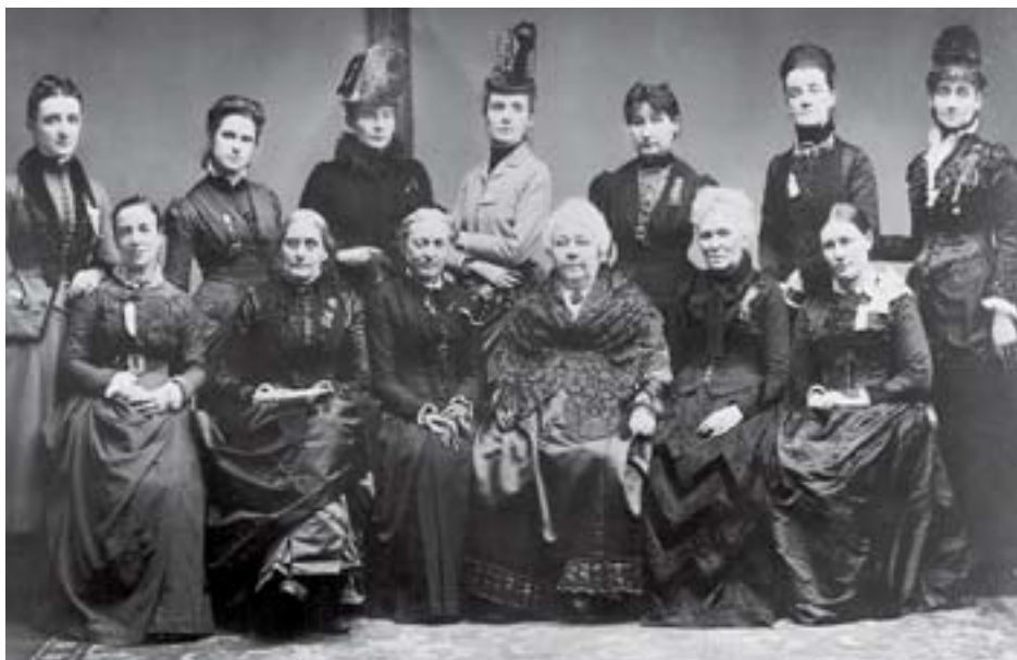
◀ In 1888, delegates to the First International Council of Women met to commemorate the 40th anniversary of Seneca Falls. Stanton is seated third from the right.

Nearly 300 women and men gathered at the Wesleyan Methodist Church for the convention. The participants approved all parts of the declaration unanimously—including several resolutions to encourage women to participate in all public issues on an equal basis with men—except one. The one exception, which still passed by a narrow majority, was the resolution calling for women “to secure to