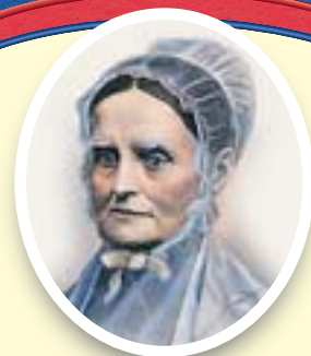
LUCRETIA MOTT 1793–1880

History has it that Lucretia Mott was so talkative as a child that her mother called her Long Tongue. As an adult, she used her considerable public-speaking skills to campaign against slavery.