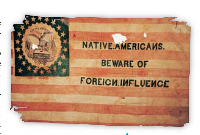
The 1854 campaign banner for the Know-Nothing Party reflects its members' fear and resentment of immigrants.

THE FREE–SOILERS Many Northerners were Free-Soilers without being abolitionists. A number of Northern Free-Soilers supported laws prohibiting black settlement in their communities and denying blacks the right to vote. Free-Soilers objected to slavery's impact on free white workers in the wage-based labor force, upon which the North depended. Abolitionist William Lloyd Garrison considered the Free-Soil Party "a sign of discontent with things political . . . reaching for something better. . . . It is a party for keeping Free Soil and not for setting men free."