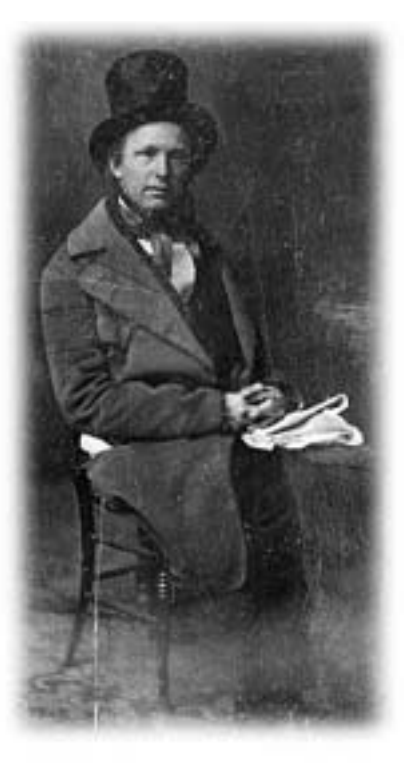
Horace Greeley founded the New York Tribune in 1841.

Greeley's appeal accurately reflected the changing national political scene. With the continuing tension over slavery, many Americans needed a national political voice. That voice was to be the Republican Party.