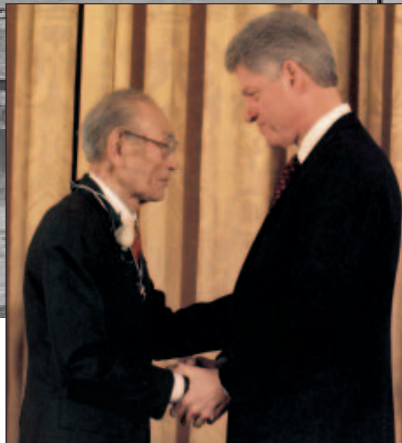
▲ President Clinton presents Fred Korematsu with a Presidential Medal of Freedom during a ceremony at the White House on January 15, 1998.

In the end, the internment of Japanese Americans became a national embarrassment. In 1976, President Gerald R. Ford repealed Executive Order 9066.