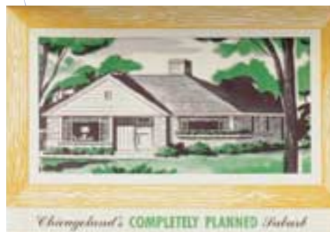
Image not available for use on CD-ROM. Please refer to the image in the textbook.

Text not available for use on CD-ROM. Please refer to the text in the textbook. Advertisements like this one for a scientifically planned Chicago suburb captured the lure of the suburbs for thousands of growing families in the 1950s. The publicity promised affordable housing, congenial neighbors, fresh air and open spaces, good schools, and easy access to urban jobs and culture. Good transportation was the lifeline of suburban growth a half century ago, and it continues to spur expansion today.