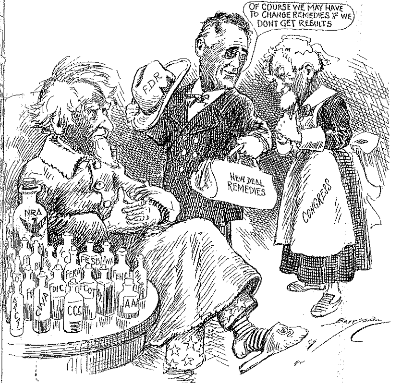
▲ An American who had left the country 21 years earlier because of too much government in business is shown returning to find Uncle Sam surrounded by the alphabet letters of New Deal programs.

OF COURSE WE MAY HAVE TO CHANGE REMEDIES IF WE DONT GET RESULTS